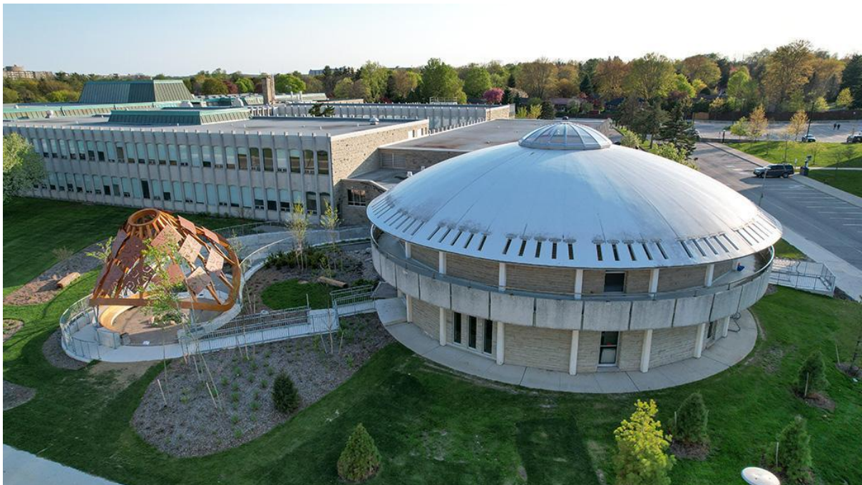
Wampum Learning Lodge | Western University Campus | 2022